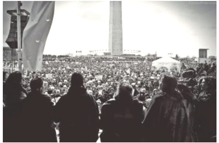
Shown above, Climate Rally and Protest against the Keystone Pipeline, February 17, 2013, Washington, DC

Stopping the pipeline will give us time to come to our senses about climate change and take steps to slow and reduce our rising carbon emissions. It will