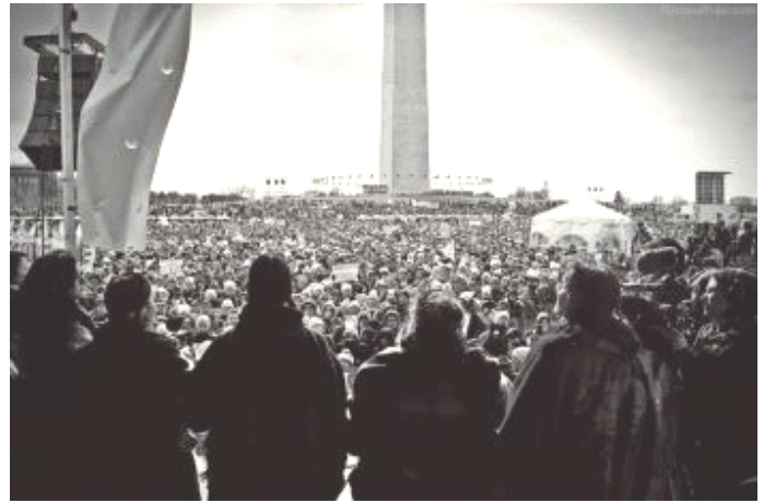
Shown above, Climate Rally and Protest against the Keystone Pipeline, February 17, 2013, Washington, DC

Stopping the pipeline will give us time to come to our senses about climate change and take steps to slow and reduce our rising carbon emissions. It will