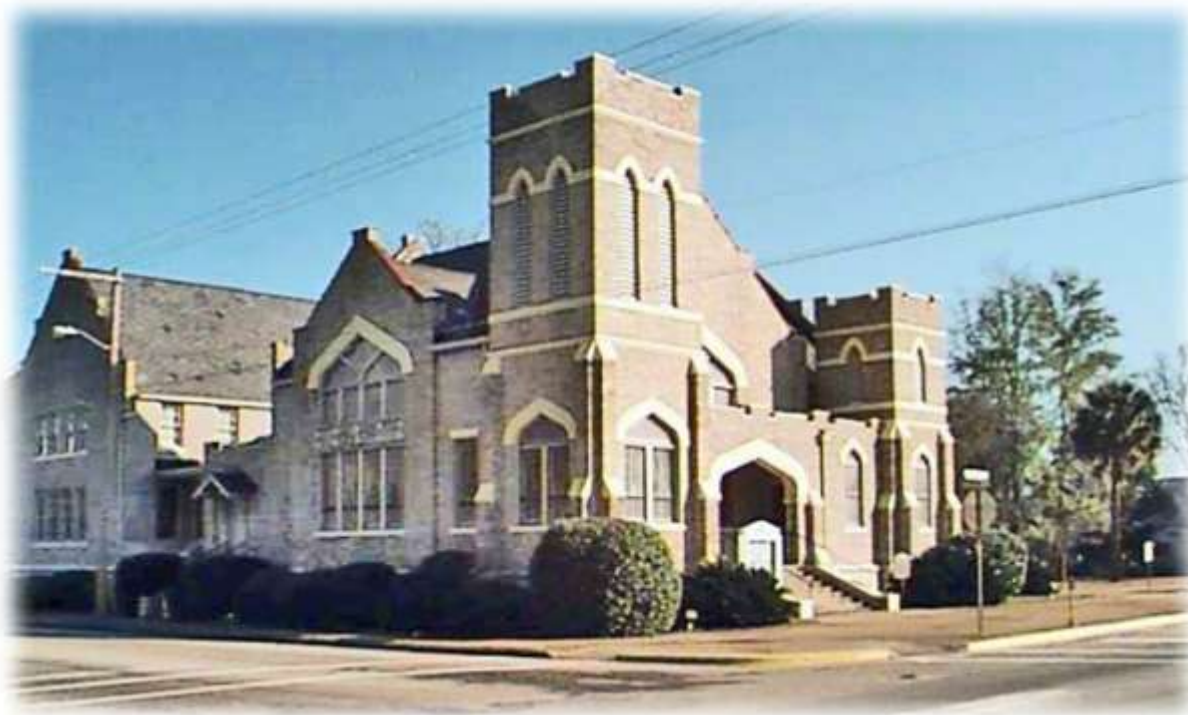
First Presbyterian Church of Marianna 4437 Clinton Street Marianna, Florida 32446

September 10, 2013 9 a.m. CDT/10 a.m. EDT